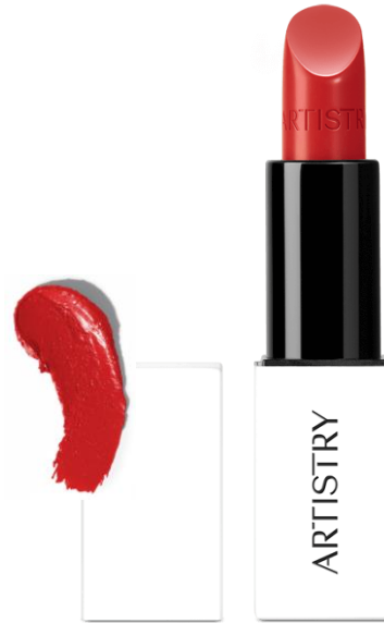
Crush on Coral