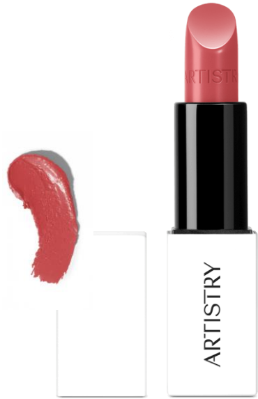
Spice Meets Nice