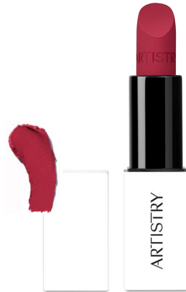
Road Trip Red