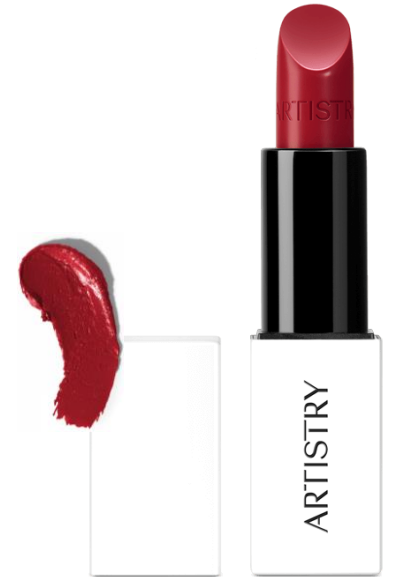
Secret Crush Scarlet