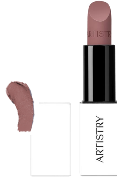
Lazy Day Latte